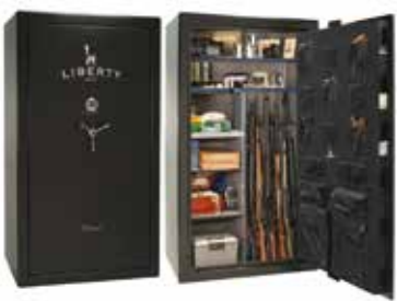
Liberty Safe Colonial 50 Black Gloss