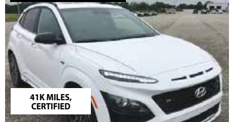
23 HYUNDAI KONA N-LINE

mitchellhyundai.com LOW PRICING $$$ $27,384