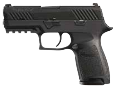
Sig Sauer 320C