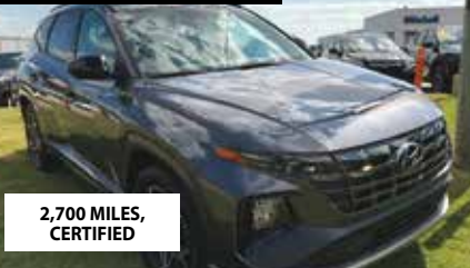
24 HYUNDAI TUSCON N-LINE

mitchellhyundai.com LOW PRICING $$$ $30,998