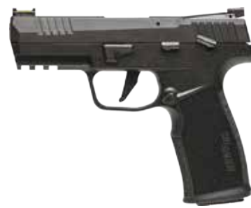
Sig Sauer 322C