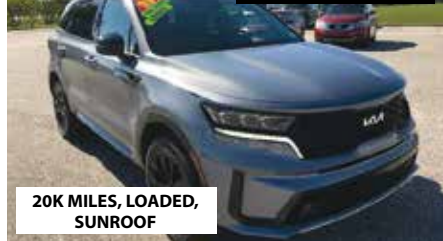
23 KIA SORENTO SX

mitchellhyundai.com LOW PRICING $$$ $21,947