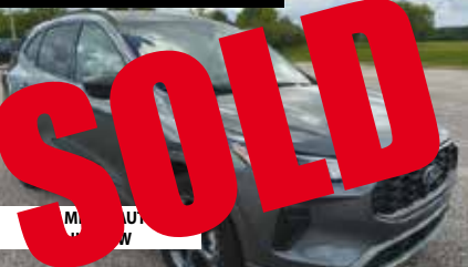
23 FORD ESCAPE ST

mitchellhyundai.com LOW PRICING $$$ $32,988