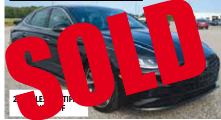
23 HYUNDAI SONATA SEL

mitchellhyundai.com LOW PRICING $$$ $32,884