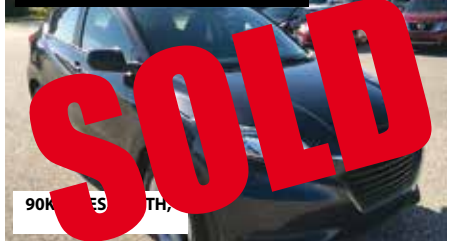
18 HONDA HR-V LX

mitchellhyundai.com LOW PRICING $$$ $21,912