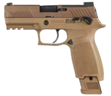
Sig Sauer 320CA