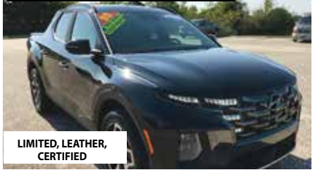
22 HYUNDAI SANTA CRUZ