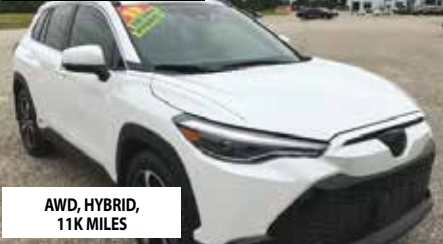
23 TOYOTA COROLLA XSE